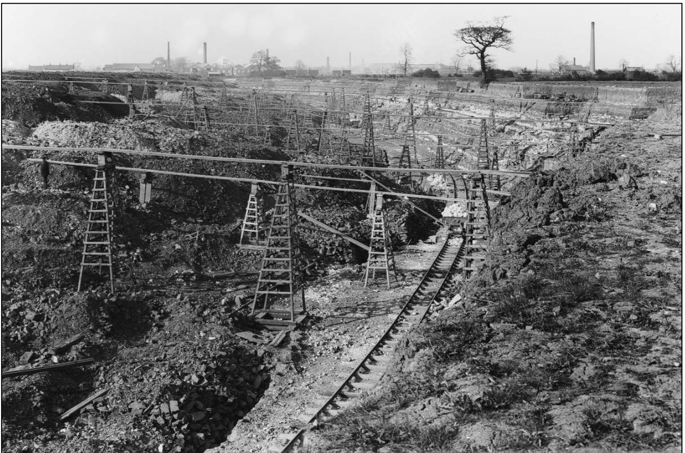
Hawton Gypsum Mine, Newark. in 1911

The Hawton site exploited mineral from a series of gypsum beds known collectively (and perhaps unsurprisingly) as the Newark Gypsum. This occurs