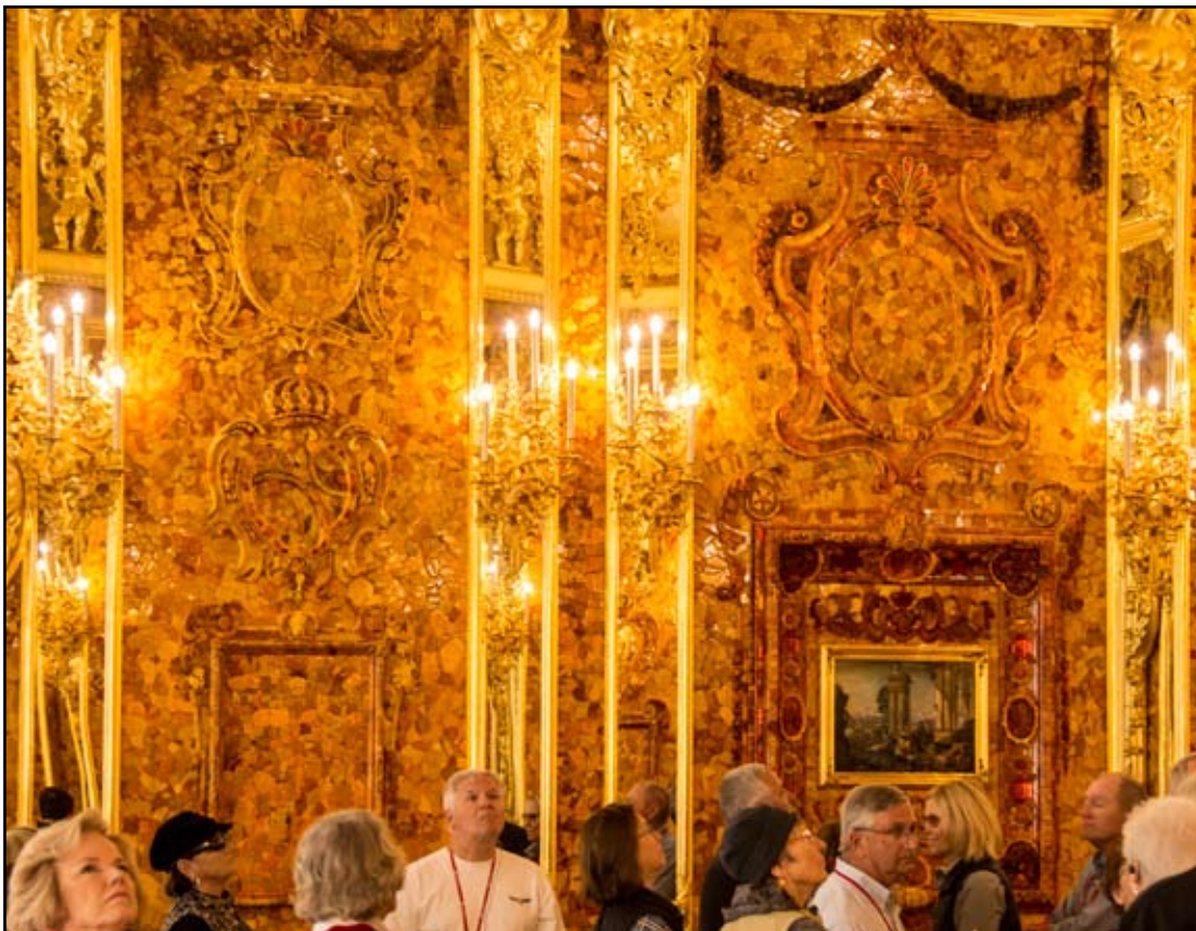
The Amber Room in the Catherine Palace, with its usual crowd of visitors, viewed from one of its doorways.