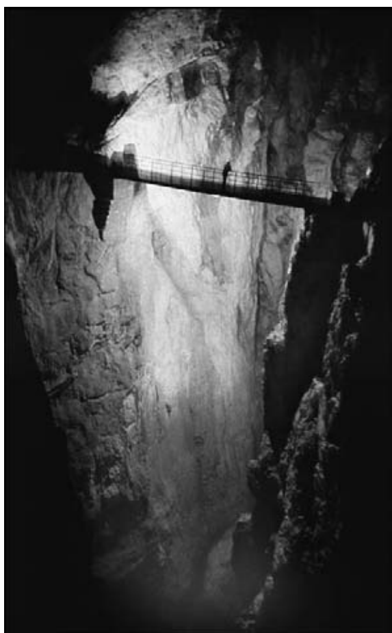
The tourist trail bridge over the underground canyon.