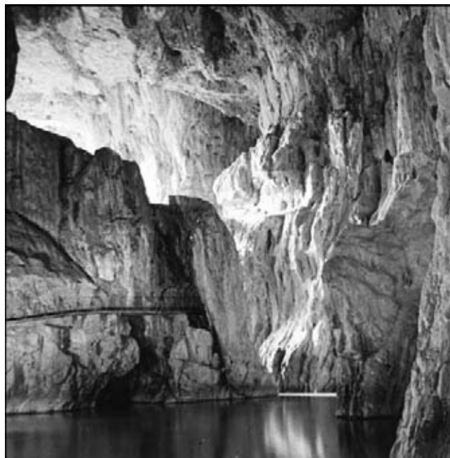
The river passage just inside from Velika Dolina.