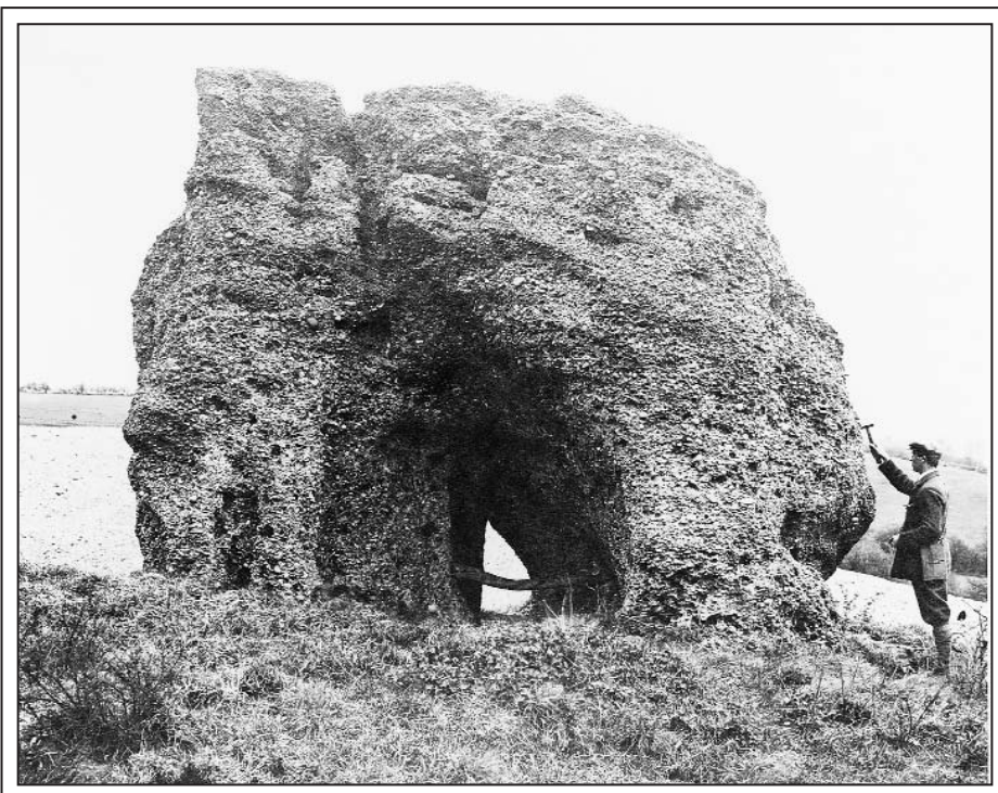
The Druids' Stone at Blidworth, as viewed from the west in 1911. Short of checking for individual missing pebbles, the rock looks exactly the same today (BGS photograph #A1175, © NERC).

Andy Howard and Paul Tod British Geological Survey; kzphoto@bgs.ac.uk